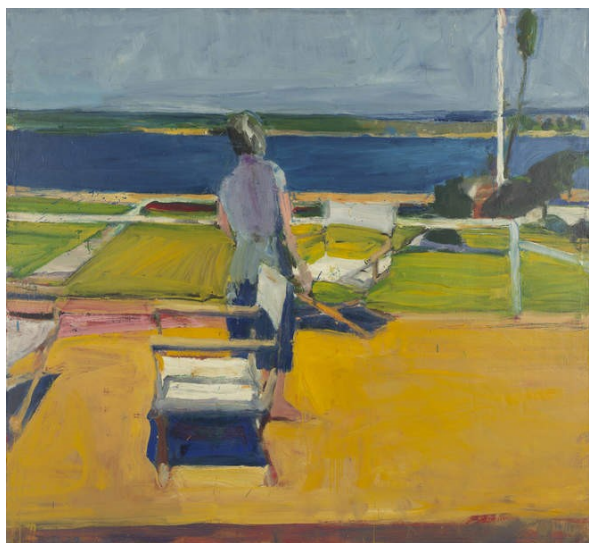
R. Diebenkorn, Figure on a porch, 1959